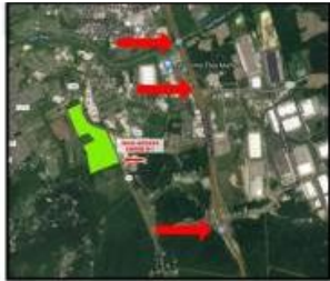
LOCATED APPROX. 1 MILE FROM THE INTERSTATE 20 ACRES AVAILABLE FOR BUSINESS USE 10 ACRES AVAILABLE FOR AGRICULTURAL USE