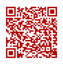
Scan above on mobile device for directions to this listing