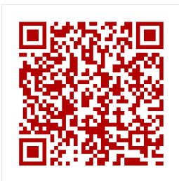
Scan above on mobile device for directions to this listing