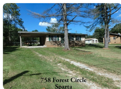
758 Forest Circle Sparta