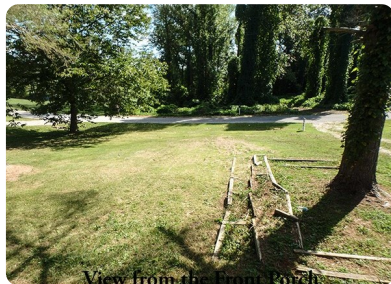
View from the front porch