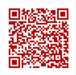
Scan above on mobile device for directions to this listing