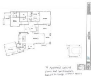
71 Applehead Island plans and specifications subject to change without notice