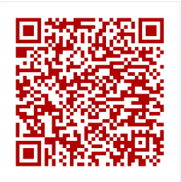
Scan above on mobile device for directions to this listing