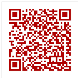
Scan above on mobile device for directions to this listing

Assist2Sell Buyer and Seller Services (541) 480-6042 jries@assist2sell.com