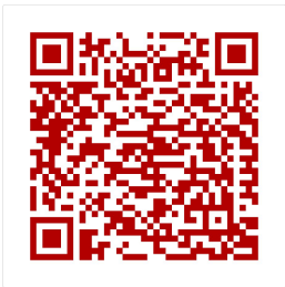
Scan above on mobile device for directions to this listing

Assist2Sell Buyer & Seller Realty (812) 945-2735 info@buyerandsellerrealty.com