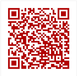
Scan above on mobile device for directions to this listing