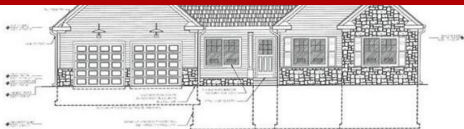
FRONT ELEVATION SCALE: 1/8"=1'-0"