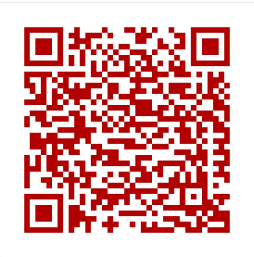
Scan above on mobile device for directions to this listing