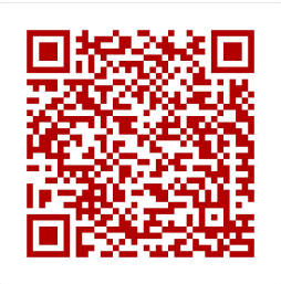
Scan above on mobile device for directions to this listing