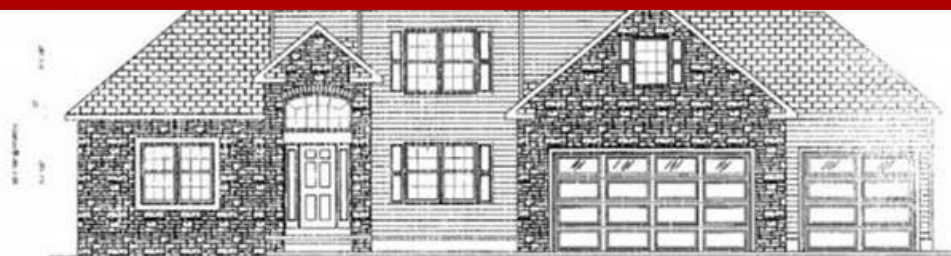
FRONT ELEVATION SCALE: 1/8"=1'-0"