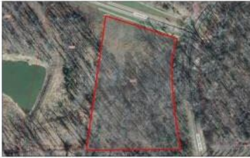
Lot 36 Gray's Creek - 2.16 acres