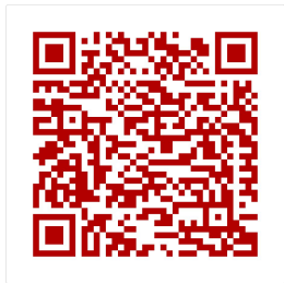
Scan above on mobile device for directions to this listing