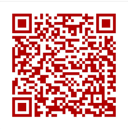
Scan above on mobile device for directions to this listing