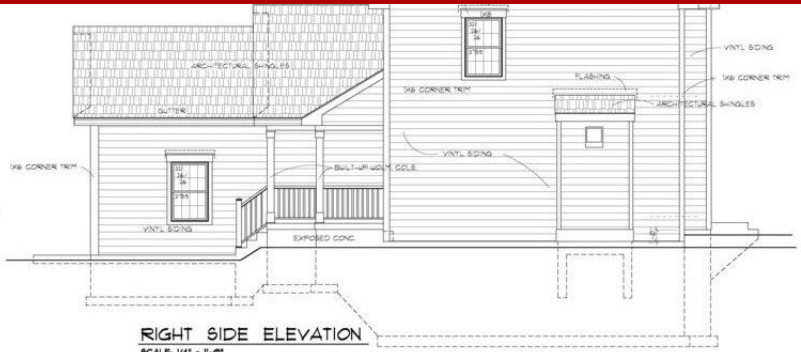
RIGHT SIDE ELEVATION SCALE: 1/4" = 1'-0"