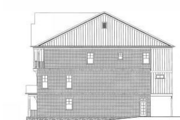
③ Right Elevation - Personal 1/8" = 1'-0"