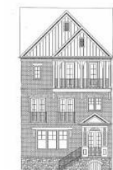
① Front Elevation - Personal 1/8" = 1'-0"