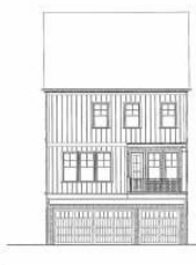
② Rear Elevation - Personal 1/8" = 1'-0"