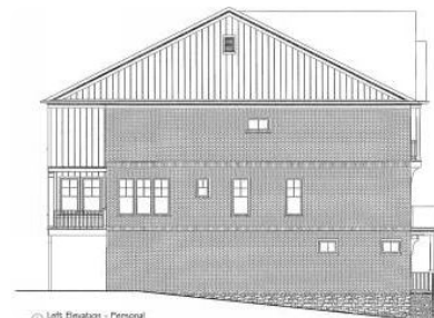
④ Left Elevation - Personal 1/8" = 1'-0"