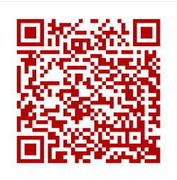
Scan above on mobile device for directions to this listing