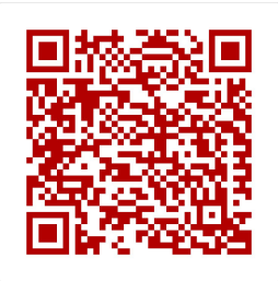
Scan above on mobile device for directions to this listing