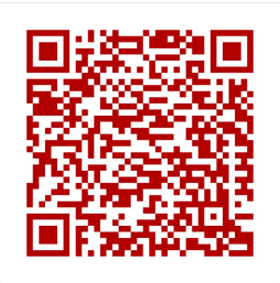
Scan above on mobile device for directions to this listing