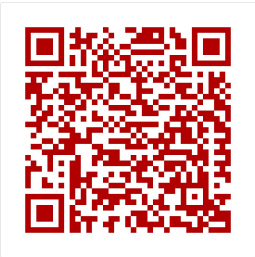
Scan above on mobile device for directions to this listing