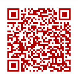
Scan above on mobile device for directions to this listing