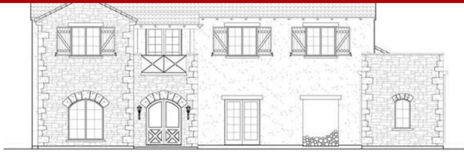
ENTRADA LOT 02, BLOCK H