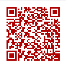
Scan above on mobile device for directions to this listing