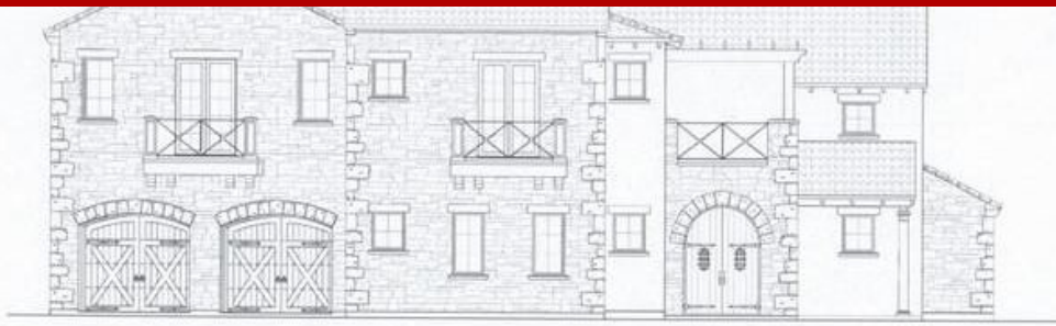
ENTRADA LOT 01, BLOCK H