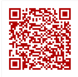
Scan above on mobile device for directions to this listing