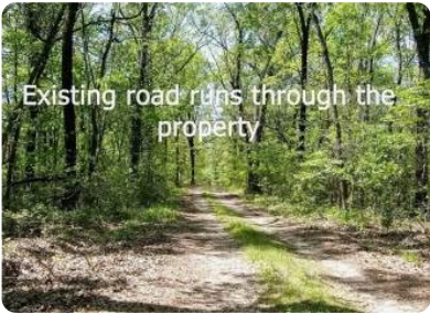
Existing road runs through the property