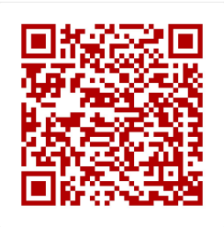
Scan above on mobile device for directions to this listing