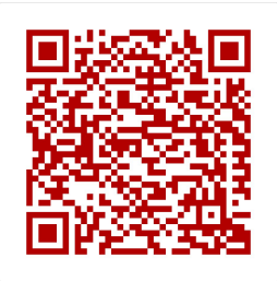
Scan above on mobile device for directions to this listing